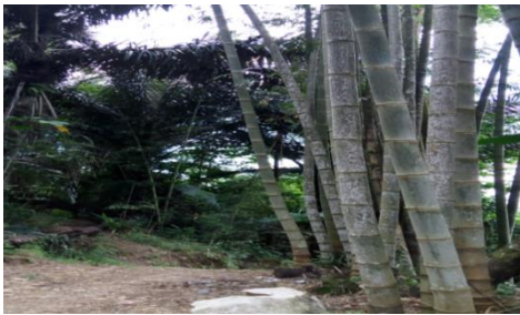
Figure 1. Petung bamboo ( Dendrocalamus asper ) Grows up in the Toraja area