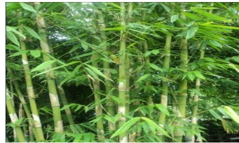
Figure 2. Wulung bamboo ( Gigantochloa atroviolacea ) Grows up in the Toraja area